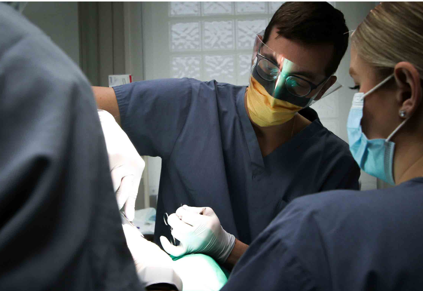
carcinomas (BCCs) and squamous cell carcinomas (SCCs), the two most common types of skin cancer.

"(Going to the U.S. from Gersue is processed, fewer medications many), we spend three or four days required during the process leading going through that operation," said soon.